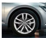
18" Dartford 235/45