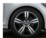
18" Kalamata 245/45