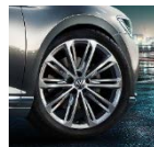
19" Verona 235/40