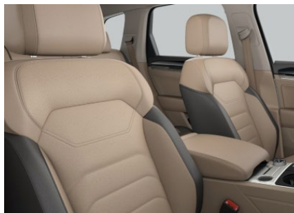
Atacama Beige – Atmosphere (YF)