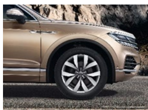
V6 S 20-inch Montero 285/45