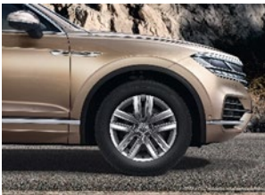
V6 19-inch Esperance 255/55