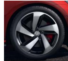
18" Milton Keynes Allow Wheel (225/40)