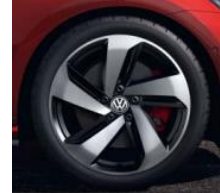
18" Milton Keynes Allow Wheel (225/40)